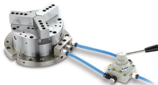
Split type hand control valve